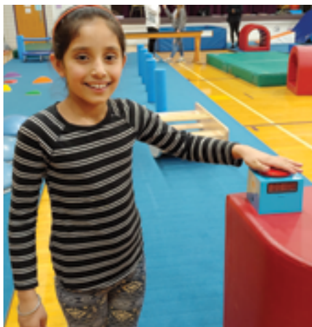
A student at Bell Creek Intermediate School in Bellbrook, OH, completes the obstacle course as part of the health. moves. minds. kickoff event.