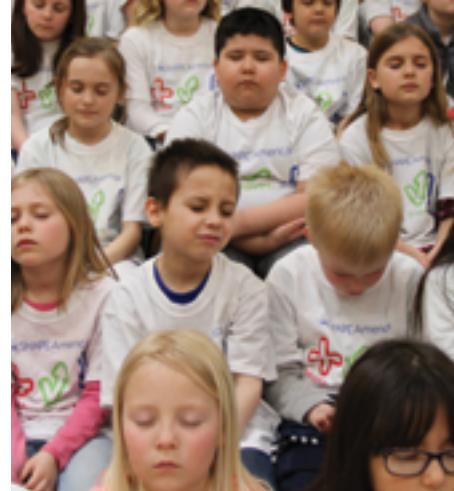
Students take part in a "mindful minute" activity at Sibley East Elementary School in Gaylord, MN.

“My students' success is the most important thing, and with this new program the sky is the limit!”