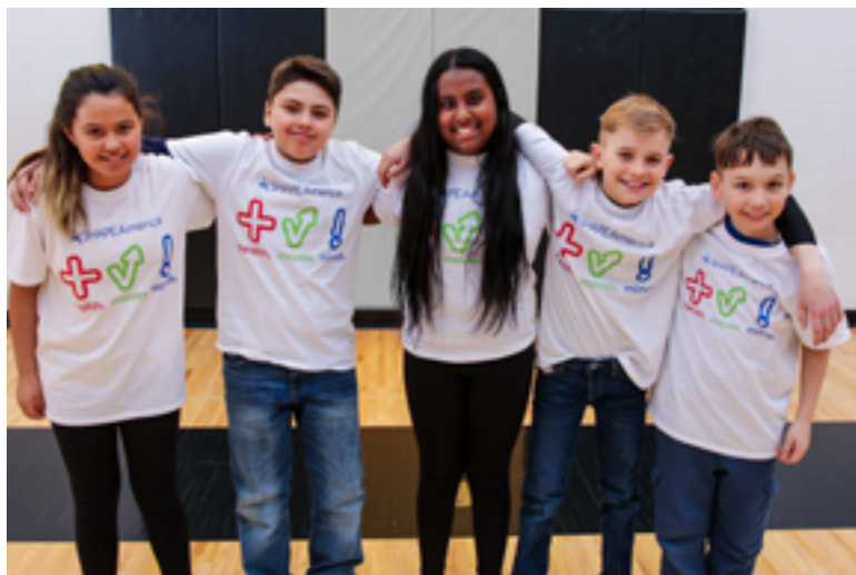
Students at Sibley East Elementary School in Gaylord, MN.